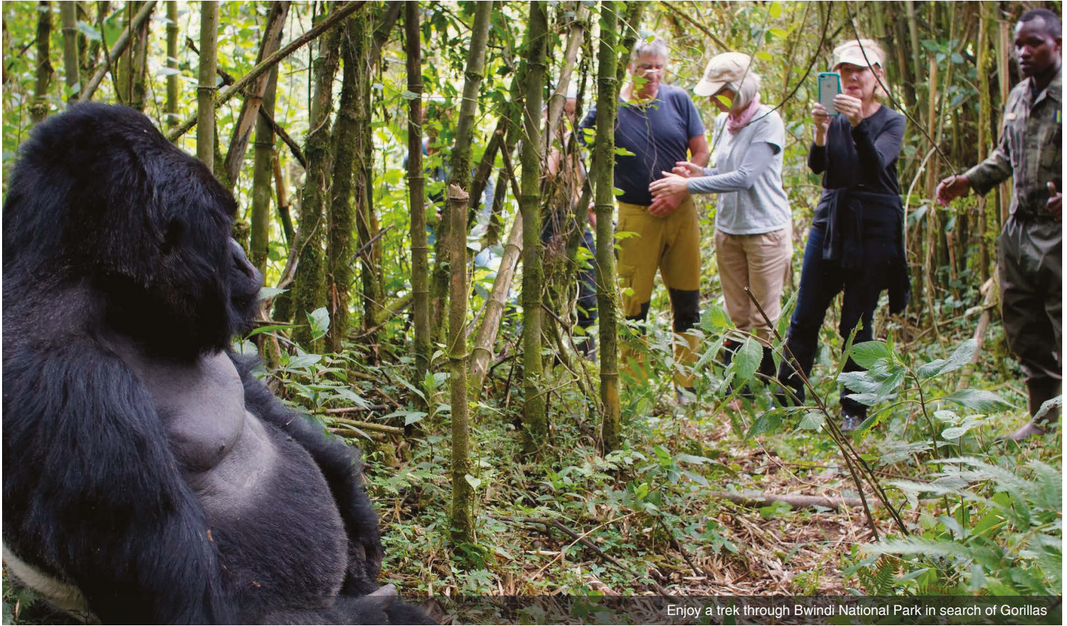
Enjoy a trek through Bwindi National Park in search of Gorillas