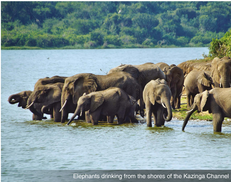
Elephants drinking from the shores of the Kazinga Channel

hyenas before they retreat into the woods to seek shelter from the sun. This afternoon, a different adventure is in store as you set sail on the Kazinga Channel, exploring the waterway known for its various bird species and hippo population. Elephants are often seen drinking from the shores, water buffalo bask in the mud, warthogs run along the shore and plenty of birds inhabit the trees. Spend the evening relaxing at the lodge or enjoy an early-evening game drive through the park. Meals: B, L, D